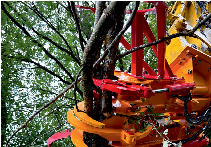
Schnitt-Griffy HS 800 SE with SG 800 in action