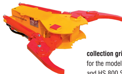
collection gripper SG 800 for the models HS 800 and HS 800 SE

On the road, by the side of rivers, in the forest, for land-scraping and landscape conservation, for Common Osiers (willow trees), on railways, for overland power lines, and much more.