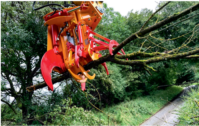
Schnitt-Griffy HS 800 SE with SG 800 in grippermode