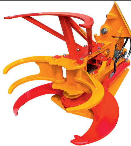
Schnitt-Griffy HS 800 SE